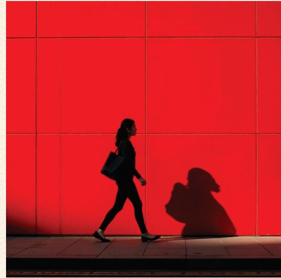
Entertainment Venues & Lifestyle Spaces