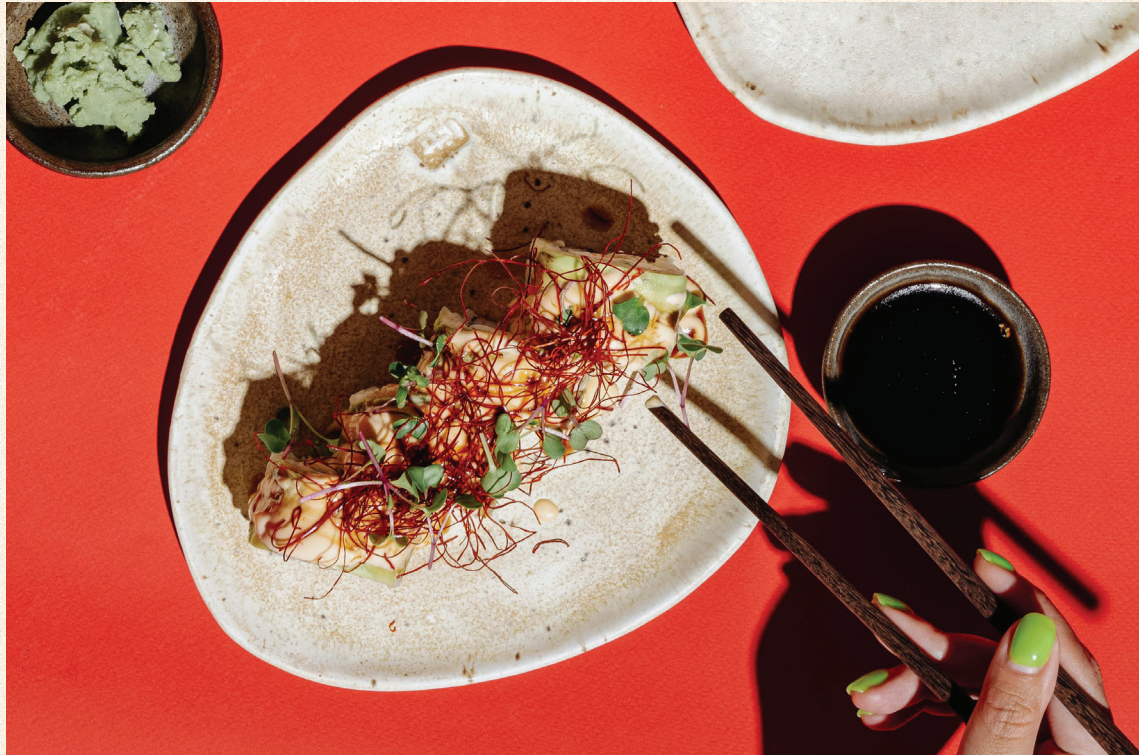
Retail & Dining Promenade